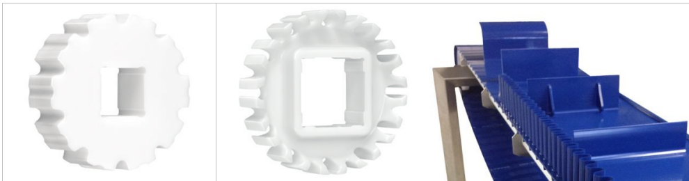
Sprockets Habasit® Cleandrive series