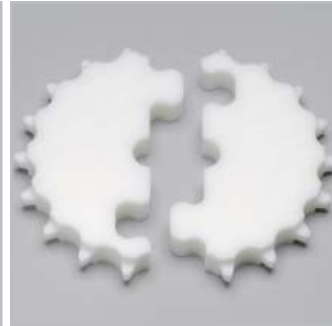
Puzzle split sprocket