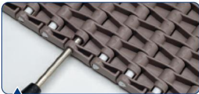
Using a punch from the same end of swedge, punch swedge through the belt.