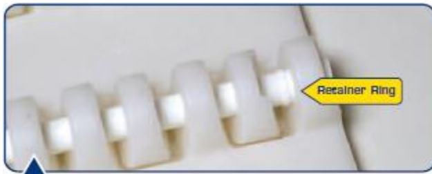
Use a gate cutter to cut the end rod on both sides of the retainer ring, just inside the first finger. (First cut the "inner side," and then cut the "outer finger" side.)