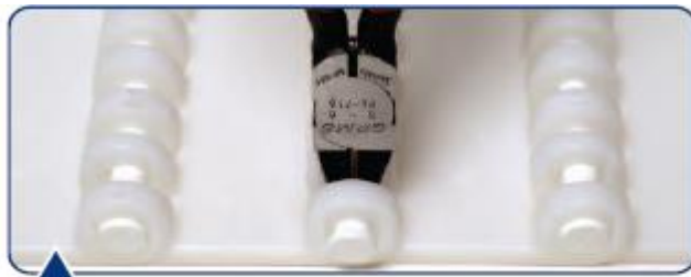
Cutters can be used to pry out the headed rod. After this, use a pin to push out the remaining rod.

Replace all removed rods as they will be damaged during disassembly.