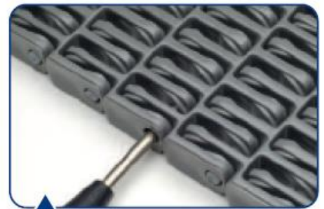
tap rod through from other side.

Replace all removed rods as they will be damaged during disassembly.