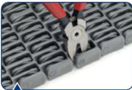
Cut both sides of retainer ring.