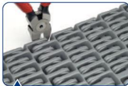
Support shoulder with open cutters and...