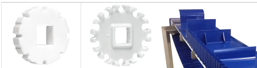
Sprockets Habasit® Cleandrive series

This product has not been tested according to ATEX standards (atmospheres with explosion risk - ATEX 95 regulation or EU directive 2014/34/EU) and therefore is subject to user's analysis in the respective environment