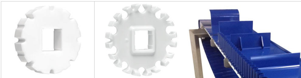
Sprockets Habasit® Cleandrive series