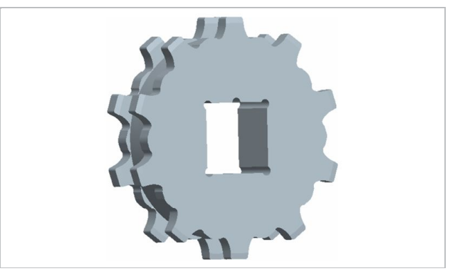
Sprocket one-piece double-row (solid)