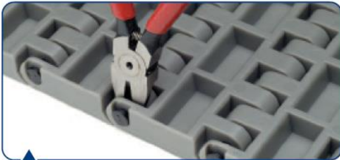
▲ Cut both sides of retainer ring.