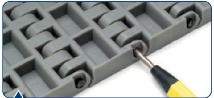
▲ Using a punch opposite the head, tap head and ring out of belt.

Replace all removed rods as they will be damaged during disassembly.